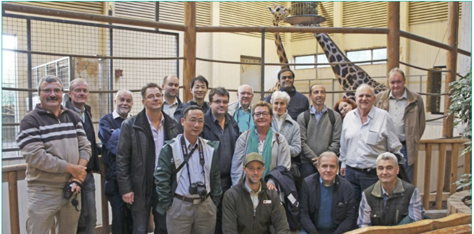
Group picture from an appreciated guided tour at the Borås Zoo.