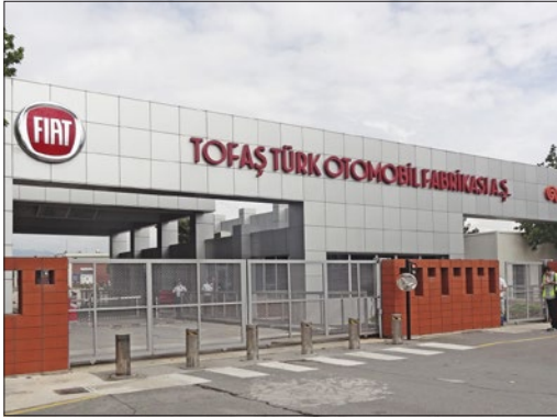
The customer visits included the Fiat Tofaş plant in Bursa.