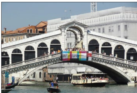
Ponte di Rialto , also known as the Rialto Bridge, is the oldest of the four bridges over the Grand Canal in Venice, Italy.